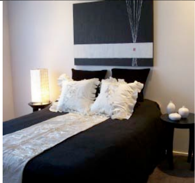
Black and White – The ruffles of the roses and sheen of the pearls are replicated in the bed linen (Limited edition by Sophie Lui) and the harshness of the black and white contrast toned down with odd shaped vases and handmade shell lamp