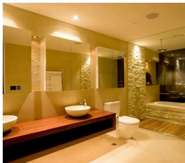
Neutrals – Inspiration for this bathroom – texture, colours and shape